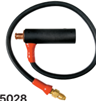
225028 50 mm thread-lock-style for water-cooled torch.