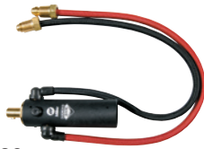
195380 50 mm Dinse-style gas thru with gas and water return lines for water-cooled torch.