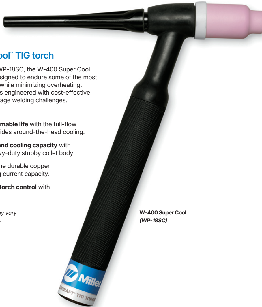
W-400 Super Cool (WP-18SC)

Note: Torches delivered may vary slightly from images shown.