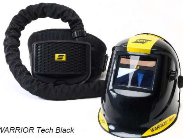
WARRIOR Tech Black with ESAB PAPR