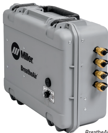
BreatheAir portable box