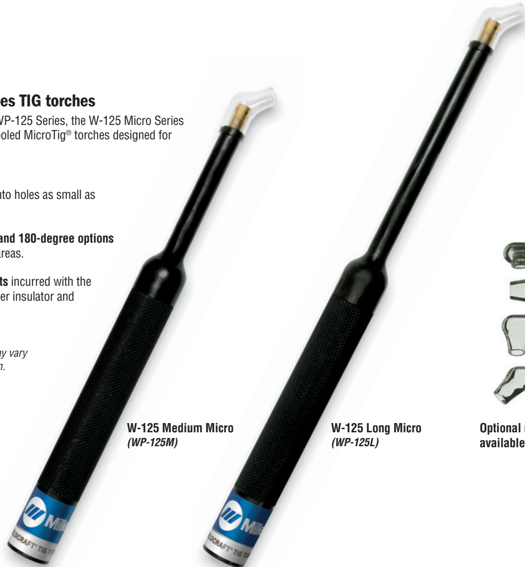
W-125 Medium Micro (WP-125M)

Note: Torches delivered may vary slightly from images shown.