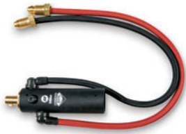
195380 50 mm Dinse-style gas thru with gas and water return lines for water-cooled torch.