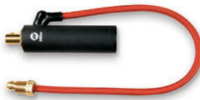
195377 50 mm Dinse-style with water return line for water-cooled torch.