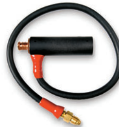
225028 50 mm thread-lock-style for water-cooled torch.